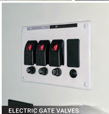
ELECTRIC GATE VALVES