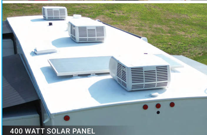
400 WATT SOLAR PANEL