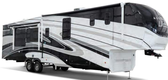
Full Body Paint Option Black