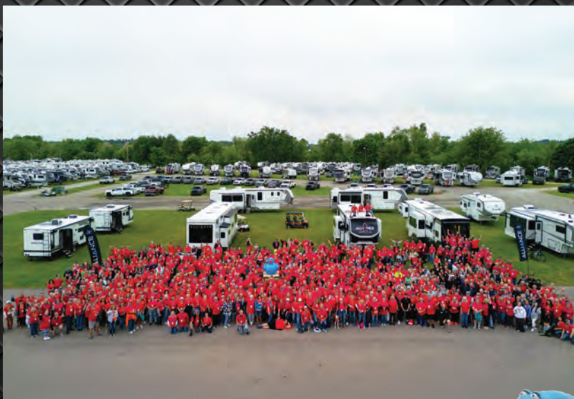
2025 Alliance Owner's Rally / Elkhart, Indiana

We are honored you have taken the time to learn more about Alliance RV and look forward to your feedback and support as we execute our vision. If you are as obsessed with building a better RV ownership experience as we are, this is only the beginning of a very rewarding long-term 'Alliance'.