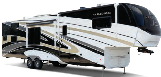
Full Body Paint Option Gold