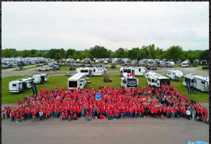
2025 Alliance Owner's Rally / Elkhart, Indiana

We are honored you have taken the time to learn more about Alliance RV and look forward to your feedback and support as we execute our vision. If you are as obsessed with building a better RV ownership experience as we are, this is only the beginning of a very rewarding long-term 'Alliance'.