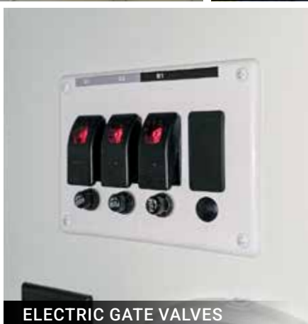
ELECTRIC GATE VALVES