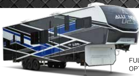
FULL BODY PAINT OPTION BLUE