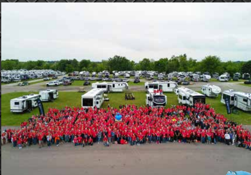
2025 Alliance Owner's Rally / Elkhart, Indiana

We are honored you have taken the time to learn more about Alliance RV and look forward to your feedback and support as we execute our vision. If you are as obsessed with building a better RV ownership experience as we are, this is only the beginning of a very rewarding long-term 'Alliance'.