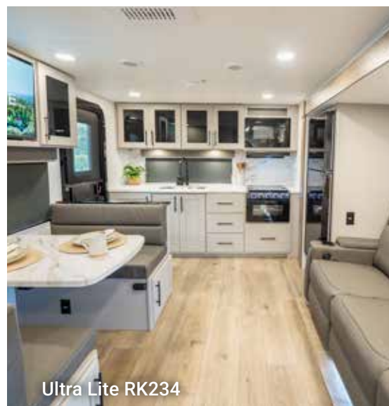
Ultra Lite RK234