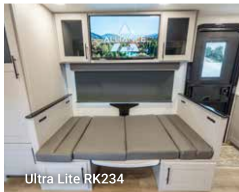
Ultra Lite RK234