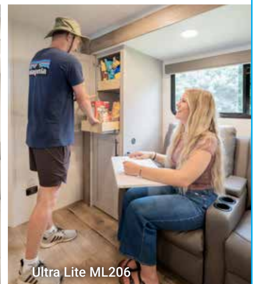
Ultra Lite ML206