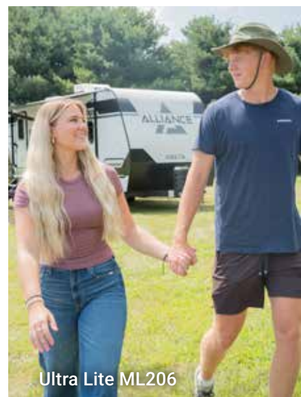
Ultra Lite ML206