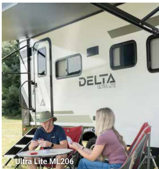
Ultra Lite ML206