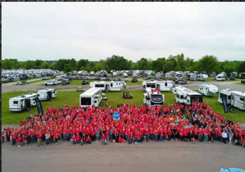
2025 Alliance Owner's Rally / Elkhart, Indiana

We are honored you have taken the time to learn more about Alliance RV and look forward to your feedback and support as we execute our vision. If you are as obsessed with building a better RV ownership experience as we are, this is only the beginning of a very rewarding long-term 'Alliance'.