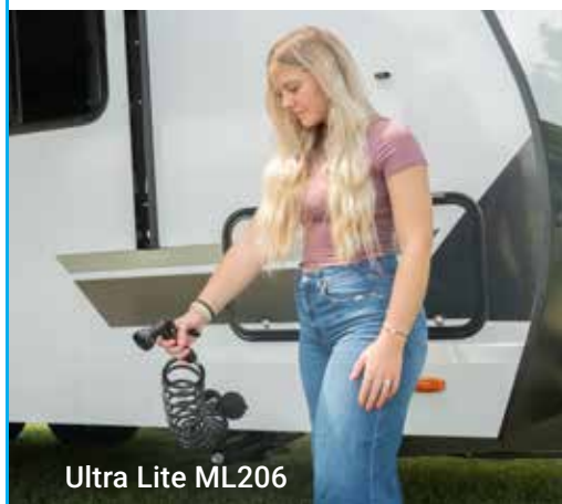
Ultra Lite ML206