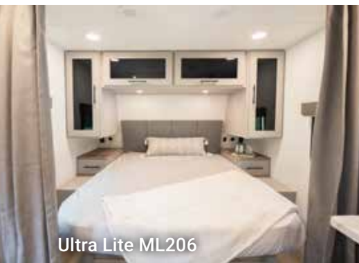
Ultra Lite ML206