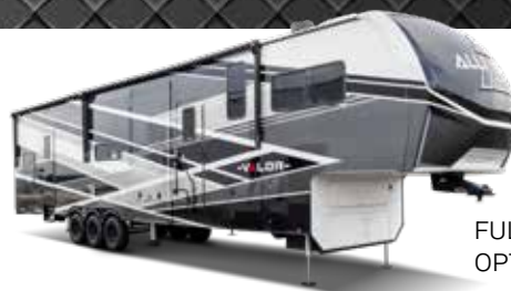
FULL BODY PAINT OPTION SILVER