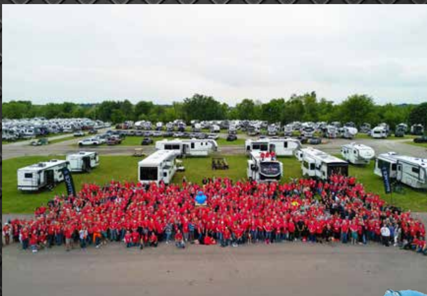
2025 Alliance Owner's Rally / Elkhart, Indiana

We are honored you have taken the time to learn more about Alliance RV and look forward to your feedback and support as we execute our vision. If you are as obsessed with building a better RV ownership experience as we are, this is only the beginning of a very rewarding long-term 'Alliance'.