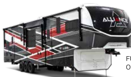
FULL BODY PAINT OPTION RED