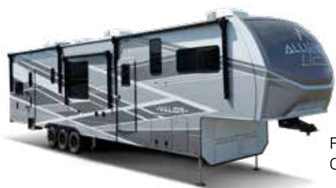
FULL BODY PAINT OPTION SMOKE