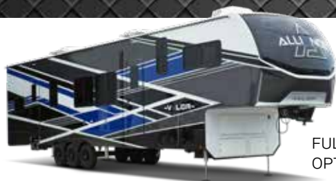
FULL BODY PAINT OPTION BLUE